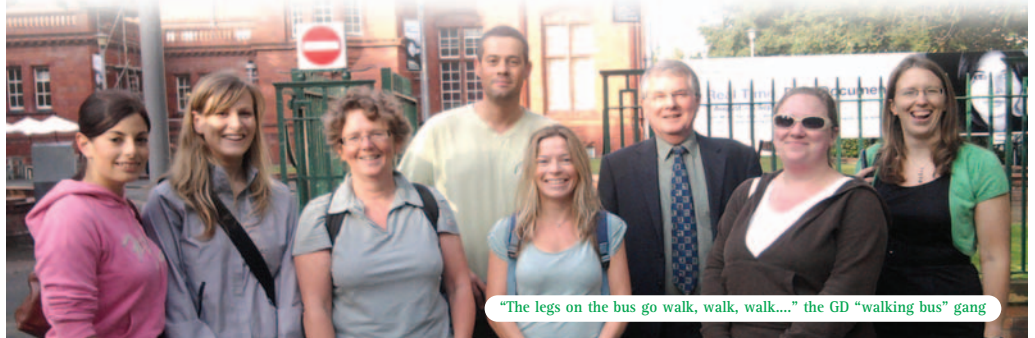
"The legs on the bus go walk, walk, walk..." the GD "walking bus" gang