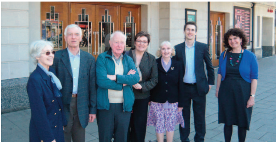
Some of the guests of the first Diamond Client social event at Stockport Plaza Theatre.