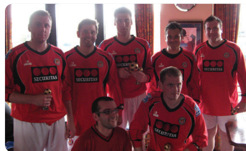
The winning Securitas team with their trophies

So what have we been up to? Well, the more sporting ones amongst us put on a charity 5-a-side tournament in July to help us reach our fundraising total. 18 teams entered with Securitas emerging as overall winners, defeating RSM Tenon 2-1 in the final.